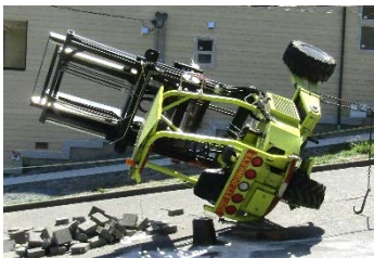
The three-wheel drive forklift shown as it is being winched by a cable onto a tow truck's flatbed.